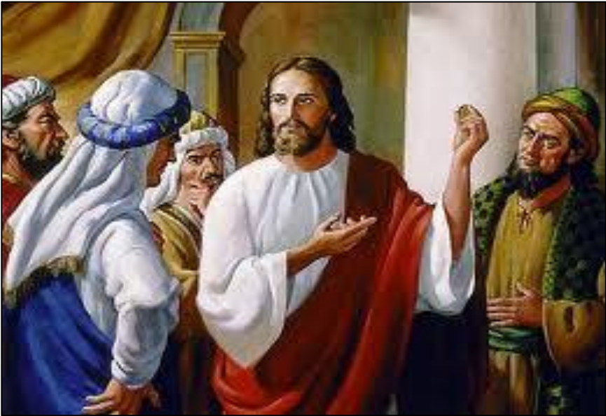
John 8 : 58